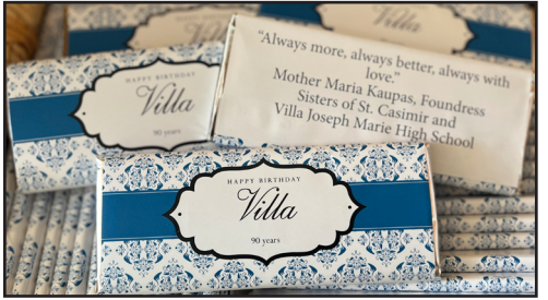
90th Anniversary chocolate bars with Mother Maria's famous quote, "Always more, always better, always with love."