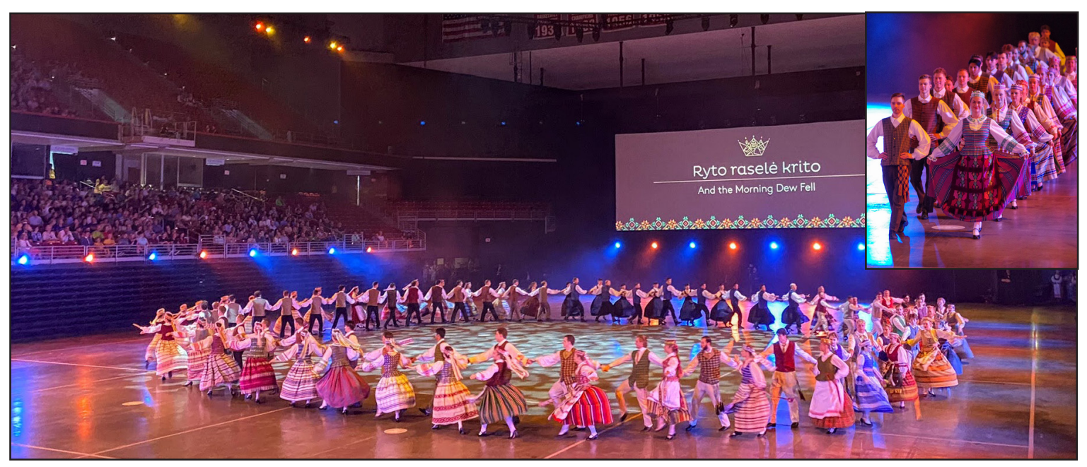
Circle dance performance at the 16th Lithuanian Dance Festival, Liacouras Center, Temple University, Philadelphia, PA.