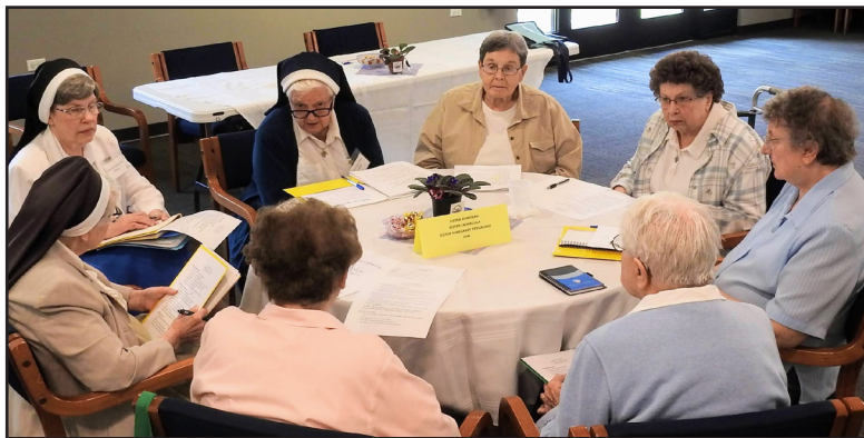
Each delegate discerns the journey we must begin.

At this same time, the Sisters became more active in peace and justice issues through SWOP, the Southwest Organizing Project, feeding the people in our neighborhood at our St. Elizabeth Food Pantry, joining in peace and cease fire marches, going to Springfield, Illinois, to rally for changes to banking laws to stop predatory lending, to supporting immigration and housing issues.