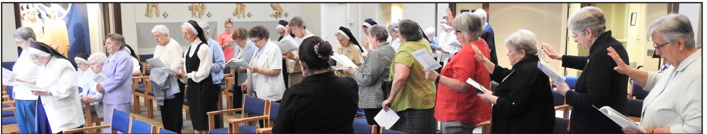
Sisters extend their hands in blessing the delegates.