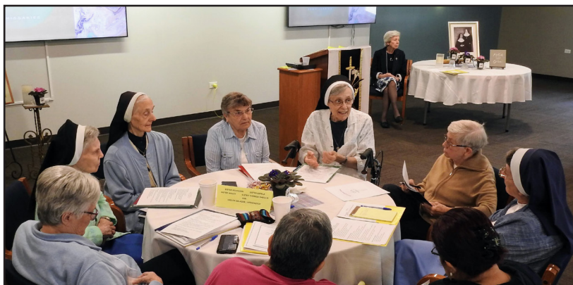
Sisters share with openness, respect, and peace to the blessing of the Spirit.