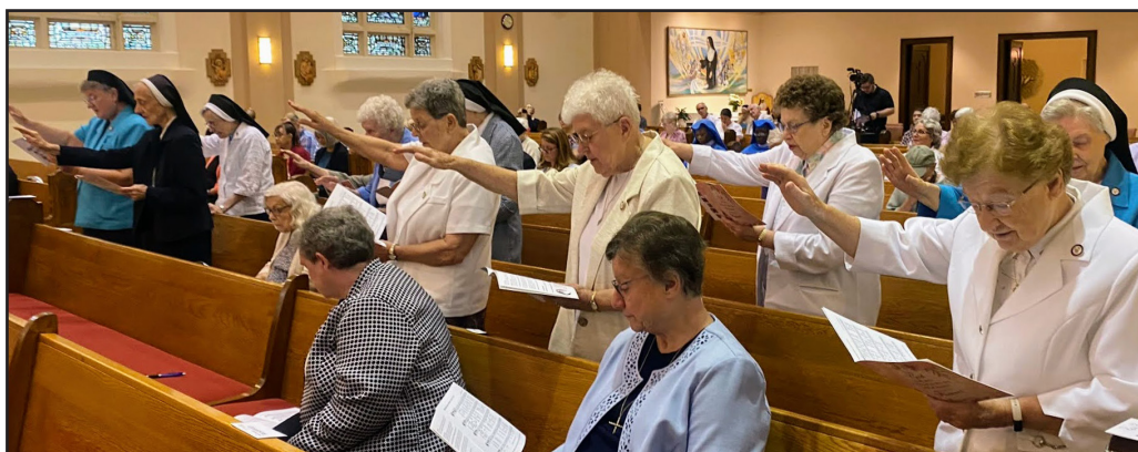
Sisters extend their right hand to pray over the Transitional Leadership Team during the blessing.