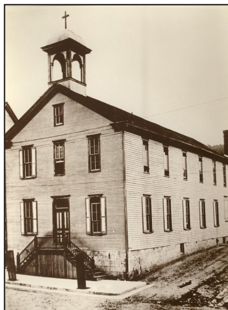
Holy Cross School in Mount Carmel, PA, the first Sisters of St. Casimir School (1908).

The prayer group meets regularly to pray for Mother Maria's beatification,