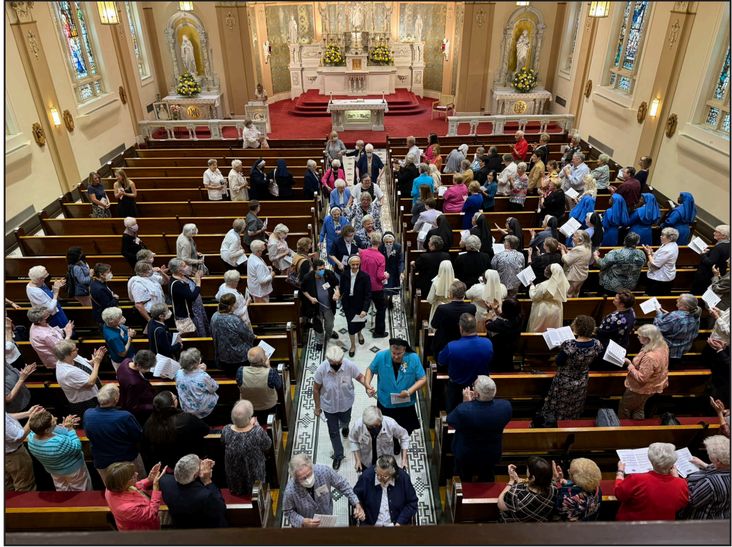
Sisters of the Immaculate Heart of Mary join hands with the Sisters of St. Casimir at the conclusion of Mass at St. Casimir Center (Motherhouse) Chapel.