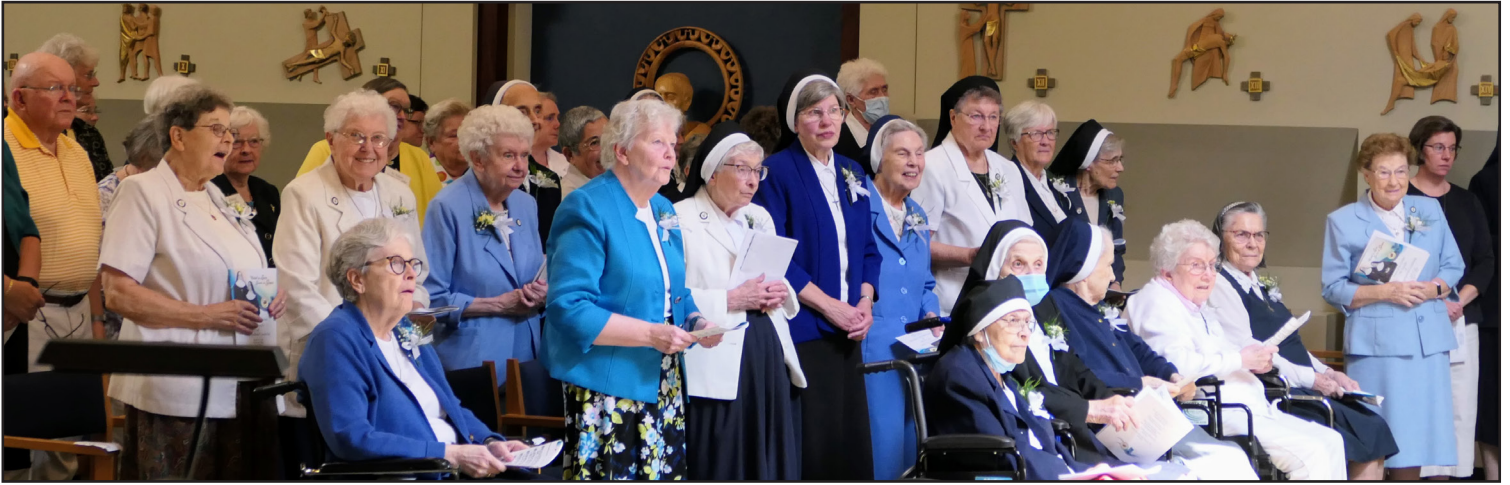
Sisters of St. Casimir and Sisters, Servants of the Immaculate Heart of Mary celebrate the transfer of Congregational Leadership.