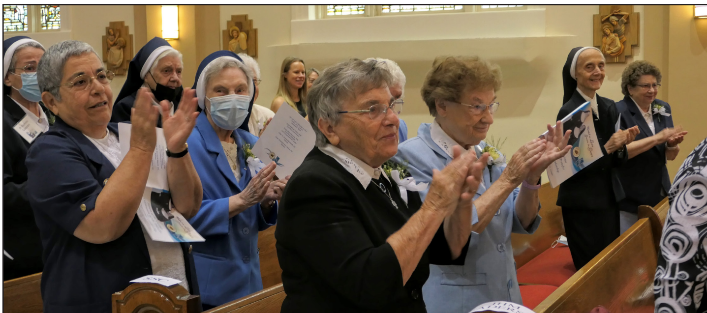
Applauding the new Leadership Team.