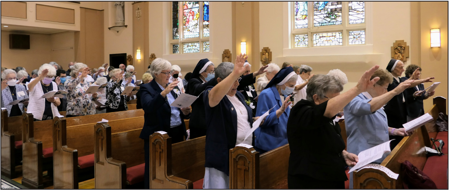
Blessings and prayers for the Leadership Team.

It has been an honor and a privilege to have worked for and with the Sisters of St. Casimir. I came to the Sisters with a broken spirit. I left many years later with a full and grateful heart. My time at the Motherhouse and the continued relationships and friendships that have been made are such a blessing!