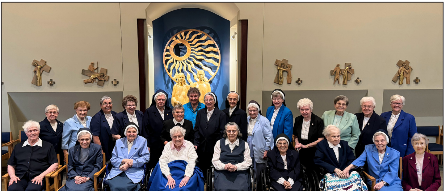
2024 Sisters of St. Casimir group photo