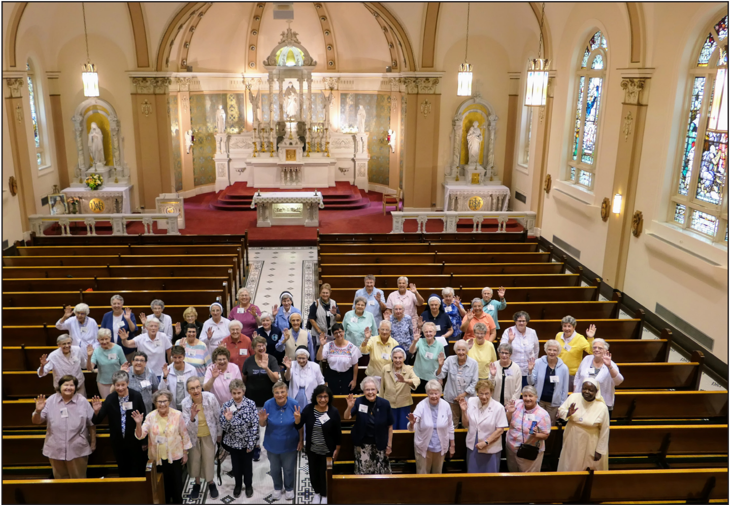
Sisters of St. Casimir, Sisters of the Immaculate Heart of Mary, Associates and friends gather in the St. Casimir Chapel